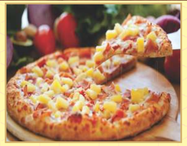
Hawaiian Pizza - $9.99 Prime quality ham, slightly sauteed pine--apple, topped with our special cheese blend.